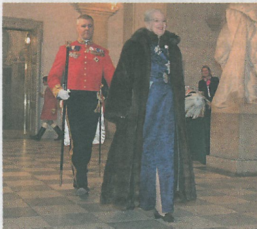
It can be intimidating meeting a monarch, which explains why she's smiling