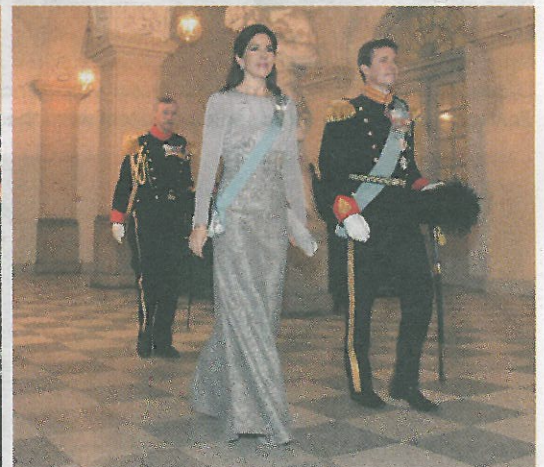
And don't forget the support, and star appeal, of these two: the Crown Prince Couple, Frederik and Mary