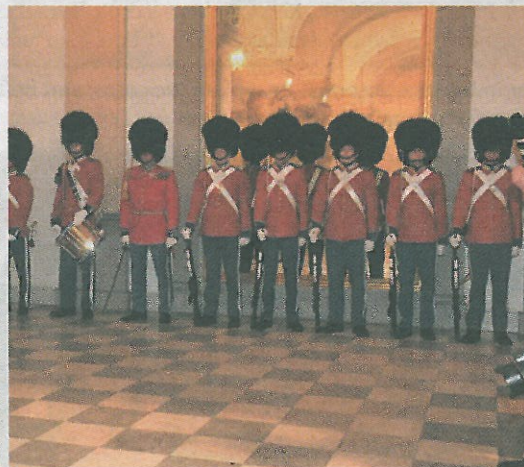
After all, she's always got plenty of back-up