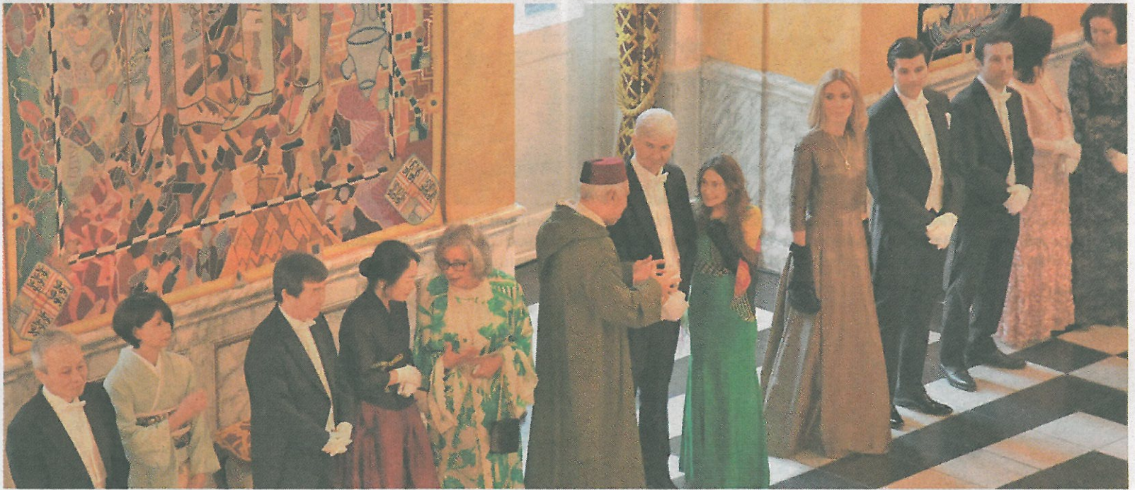
The ambassadors of (left-right) Japan, South Korea, Morocco, Argentina, Romania, Canada and Greece were among the newbies nervously (perhaps) waiting to be presented to Queen Margrethe II at the queen's reception for the diplomatic corps at Christiansborg Palace on January 3